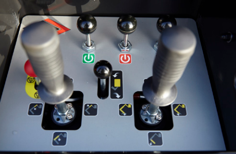
Full hydraulic controls