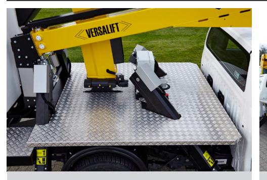
Clear deck with space for cabinets